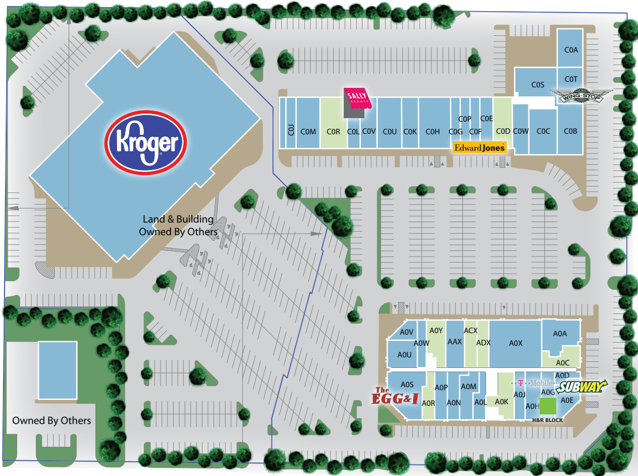
CUSTER ROAD (F.M. 2478)